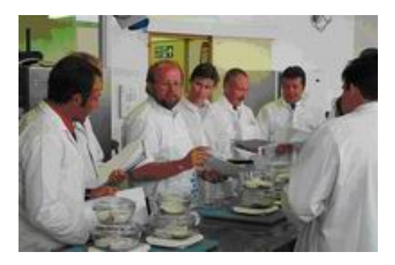
Figure 2. Fish quality assessment

Microbiological testing is also sometimes used to determine freshness quality. Total viable count (TVC) should not be used, as it is common for fish straight out of the sea to have a TVC of 1x10<sup>5</sup>-1x10<sup>6</sup>. A better correlation is seen be measuring specific fish spoilage bacteria such as Pseudomonas or Shewanella species.