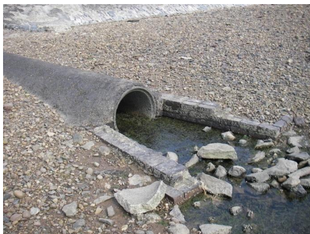
Avoid taking water from areas close to any outlet pipes

Seawater used for depuration may be sourced or abstracted from the nearest convenient point to the purification plant e.g. in an estuary, river, harbour or creek. Location of abstraction points should be away from obvious sources of faecal contamination and chemical pollution or areas that are prone to frequent disturbance of the sea/river bed. If in doubt Cefas are happy to offer advice on the suitability of proposed abstraction points.